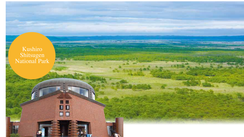
Kushiro Marsh Observatory