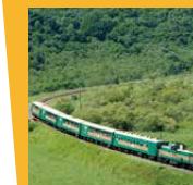
Kushiro Shitsugen Norokko-Train